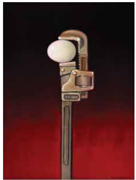
PHILIP BARLOW, PREDATOR, OIL, 18 X 14"