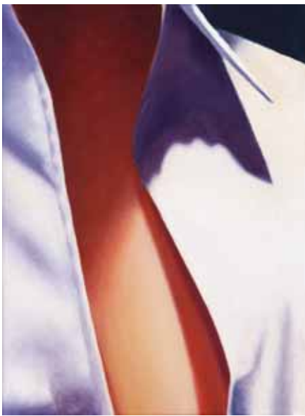
ELIZABETH BARLOW, SUMMERTIME, OIL ON LINEN, 12 X 9"