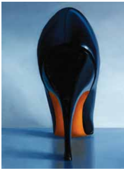
ELIZABETH BARLOW, MONUMENT, OIL ON LINEN, 20 X 16"